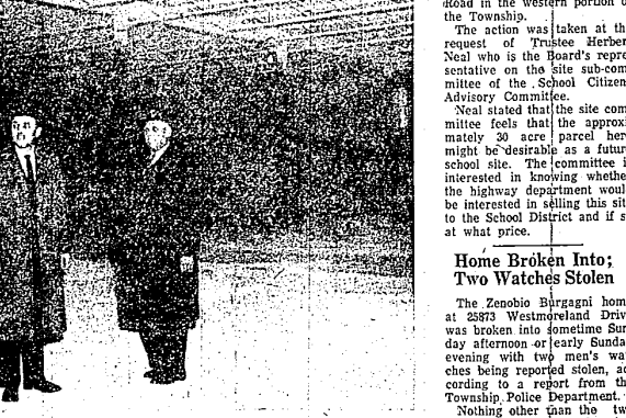
NEW INDUSTRIAL plants can mean a lot to the community in building a better tax base. Shown above looking over what is being completed in the City of Farmington should prove a big help. The Extrom Electric Controls plant at Nine Mile just east of Farmington Road is now in operation and the new Chesley Industries plant on Eight Mile Road, also just east of Farmington Road, is nearing completion. Shown above looking over what is being completed on the site subcommittee of the School Citizens Advisory Committee.

Dog owners in both the City and Township are reminded that today, Feb. 28, is the last day to get a license for a dog for 1963 without penalty. Beginning March 1 licenses will cost twice as much. The fee for a license for a male dog will be $2 for a female $4. Before getting a license it is also necessary that your dog be vaccinated and a certificate of vaccination be presented at the time a license is applied for. Joseph DeVrenti, City public health officer, stated that a crackdown on all unlicensed dogs in the city would likely be started very shortly now. There are still a lot of unlicensed dogs, he said.