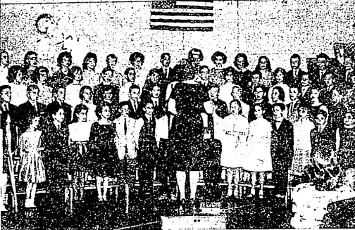
A SONG CONCERT held at the Eagle Elementary School last Monday evening, March 18, attracted a capacity crowd of parents, teachers and students. The grade-