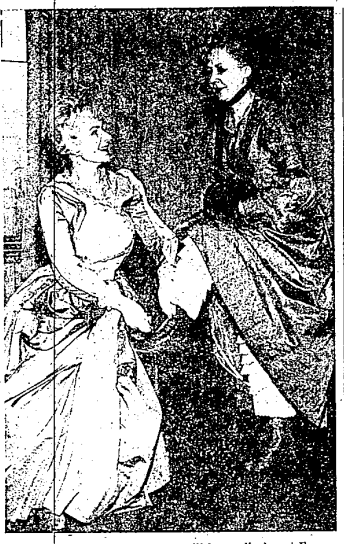
FASHIONS FROM THE PAST will be on display at Farmington's high school today. Volunteers from Goodwill Industries will be doing the modeling as part of Heritage Day festivities.