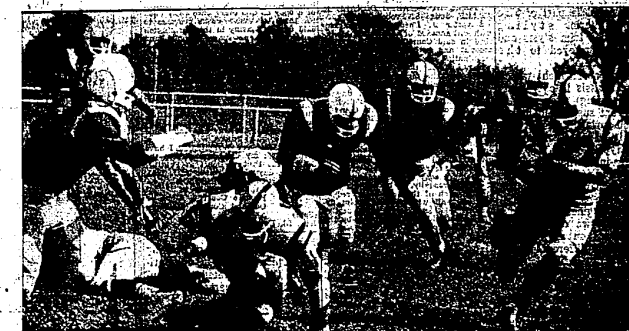
ATHLETICS AND PHYSICAL EDUCATION are an integral part of a well rounded school program.