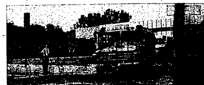
EDUCATIONAL FIELD TRIPS to Greenfield Village and other historic points of interest are important to good education.