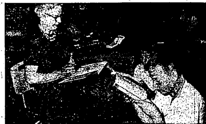
SMALL GROUPS AND INDIVIDUAL ATTENTION help to improve the reading program.