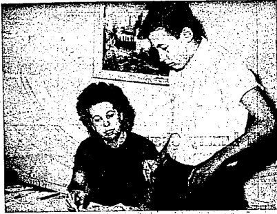
ELEMENTARY READING CLASSES are grouped according to their reading ability.