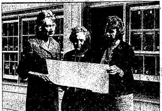
THE VILLAGE Woman's Club, 910 East Long Lake Rd., Bloomfield Hills, will open its new Education Building in time for fall classes. Shown looking over plans for this addition are the first three program chair-

CURCIO OIL CO. 32733 GRAND RIVER AVE. Phone GR. 4-5110