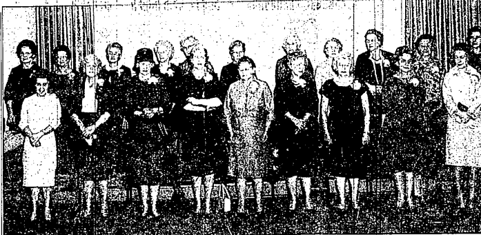
THE FARMINGTON MASONIC LODGE honored the widows of their deceased members at a special dinner held in the Farmington Masonic Temple recently. Twenty of