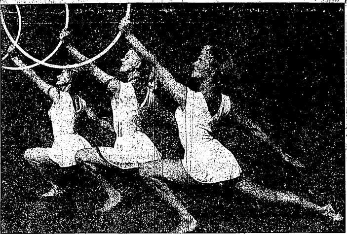
THE DANISH GYMNASTS who will appear in Farmington to stage their first American performance of the year will provide many delights for persons attending the October 28 program at North Farmington High School. The female members of the team above are using hoops in a gymnastic exercise which develops grace, posture and naturalness and also provides freedom and joy in movement.