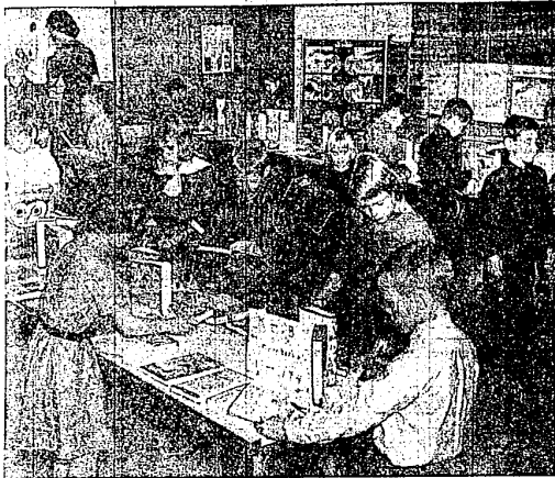
STUDENTS AT HIGHMEADOW Elementary School were provided with an opportunity to view the special library book fair display last week which is designed to aid them in selecting appropriate reading material. The youngsters above are pictured circulating around the book exhibit and browsing the offerings at the book fair.