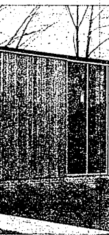
THE MODERN and attractive new building at the corner of Grand River Avenue and Lakeway will house the offices of the Our Lady of Sorrows Church Credit Union.