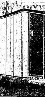
THE MODERN and attractive new building at the corner of Grand River Avenue and Lakeway will house the offices of the Our Lady of Sorrows Church Credit Union.

There's no substitute for this rule—go slow on ice and snow, says the Michigan State Highway Department.