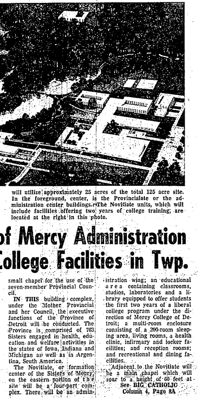
THIS IS AN ARCHITECT'S MODEL of the Sister of Mercy's major building development, which has now been put under construction on the east side of Middle Road between 11 and 12 Mile roads and the 1206 Expressway. The building to the left is the new Our Lady of Mercy High School to be built, which will utilize approximately 25 acres of the total 125 acre site.

Five of the seven Farmington Board of Education members were selected by a special committee made up of Board members and members of the administrative staff.