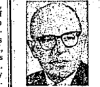
CLAPPISON and CONROY FARMINGTON INSURANCE AGENCY 33215 Grand River GR. 43511

When it comes to insurance, we can serve you better because of our experience, our training and our close connection with many of the finest companies in America. Keep us in mind — We're easy to find.