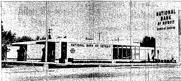
AN ATTRACTIVE NEW BUILDING to house the Farmington office of Detroit will open its doors to the public next week, Monday, June 22. The new National Bank of Detroit building at Farmington Road just north of Alta Loma (two blocks south of the familiar location on the