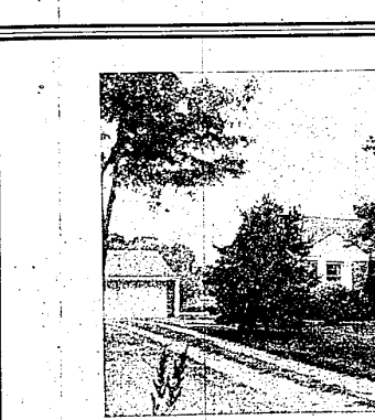
Happiness For Sale!

DATES & MORNINGSTAR REALTORS 22772 ORCHARD LAKE ROAD GR. 6-4810 Members U.N.R.A. Multi-List Service