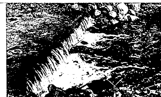
A STREAM and wooded ravine runs at the edge of the Brookdale Club property and provides a cooling change for the city worker.