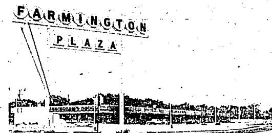
THE FARMINGTON Plaza Shopping Center which is just across Grand River Avenue from Brookdale Club provides complete shopping facilities. Other shopping centers are also located very near by.