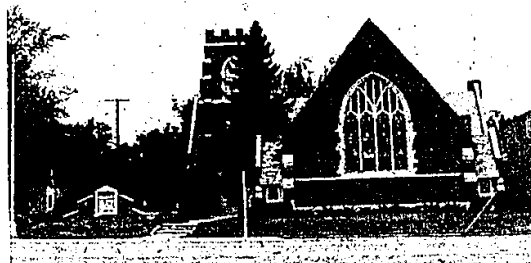
MANY CHURCHES of all denominations are located in the immediate area. Shown here is the First Methodist Church of Farmington on Grand River Avenue less than one half mile from the Brookdale Club.

Those persons talked to, with respect to the providing of a washer and dryer unit in such a convenient location, were greatly impressed. Especially those people that had lived in other apartments where coin machines were the only available units, were most particularly impressed.