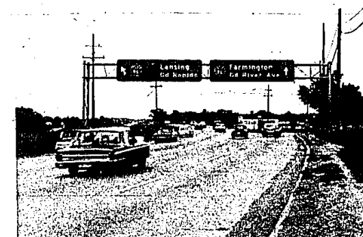
ONE OF THE expressways available to Brookdale Club is Interstate 96 which provides a non-stop route to Lansing and Grand Rapids. Just minutes to the north is Interstate 696 providing non-stop travel to Cobo Hall in Downtown Detroit and also connects up to Interstate 96 to the west.