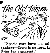
The Old Timer