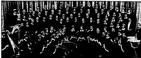
APPEARING AT THE Rosedale Gardens United Presbyterian Church on March 22 are the State Singers of Michigan State University. The concert, which will begin at 8 p.m. will include vocal and instrumental songs and musical literature. The concert is a part of the Rosedale Gardens Presbyterian Church Lenten programs. It is sponsored as a community cultural event. There is no admission charge. The church is located at W. Chicago and Hubbard Rds.