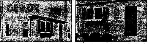
THE BEFORE AND AFTER of clean-up, paint-up activities is illustrated by these pictures of the Livonia Chamber of Commerce headquarters on Farmington Rd. The picture on the left shows the building before painting, flowers in the flower box and the new roof. In the picture on the right, Mrs. Lloyd Sprinkle