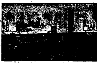
Beautiful decoration and appointments put visitors completely at ease.

four beautiful R.G. & G.R. SINCE 1910 Harris FUNERAL HOMES LIVONIA and DETROIT