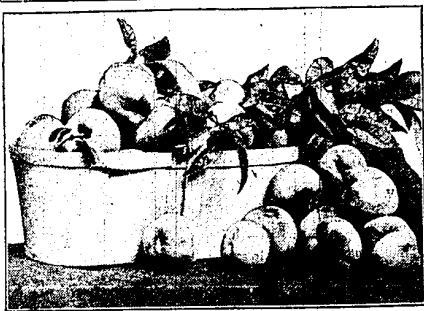
A New seedling Peach—Unusual Variety.

WHEN we see a farmer, particularly in the peach belts, buying peaches, we feel that one part of his education has been neglected. There are scores of communities in which about one-half of the residents grow their own peaches and the other half buy from them and then eat what they themselves have not raised. Peaches perhaps do best on sandy soil, but a good clay soil, thoroughly enriched and cultivated is now growing in many parts of the country excellent fruit. No matter how thrifty our peach orchard may be, constant planting is necessary to keep it thoroughly up to the mark because they develop and mature rapidly and are, therefore, short-lived. Peach trees decay more than any other fruit tree. No reason why fruit should not go to market, packed in the most attractive manner. Boxes and hampers are now being made of paper and are just as cheap as wood. There is almost as much in the selling of the fruit as in raising it and fruit that is well packed in attractive packages always brings the best prices. It is a sad mistake to plant young trees in the midst of old and over-cultivated trees, particularly when no attention is paid to the eradication of insects. It is permissible to allow a saw in