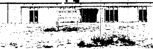
DIAMOND AUTOMATION, INC. of Farmington is about ready to begin operations in the Township's Industrial Park Area, Hagerly Road just south of Ten Mile Road. The 45,000 square foot building will house both office and manufacturing facilities for Diamond National.

THE NEW FUTURMILL PLANT now under construction in Farmington Township's Industrial Park Area, Halstead Road just south of Grand River Avenue, last week had progressed to where building contractors had completed erecting of the building's steel superstructure. The plant is scheduled for completion yet this year.