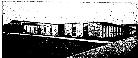
AKRON-FAIRGROVE HIGH SCHOOL, Tuscola County, will be as modern as tomorrow—a total electric school.