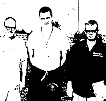
Farmington High during the 1958 season. The Falcon Junior Varsity team is in the midst of one of its finest seasons with a record of 4 and 2 with two games remaining, a home stand against Roseville this Thursday and the clash with North Farmington Reserves on the Raider gridiron Nov. 11.

An official bond resolution to provide for a sanitary sewer improvement project on a special assessment basis in Grand River Homes Subdivision was adopted by the Township Board at its regular meeting Monday night. Grand River Homes Subdivision is located in the southeastern portion of the township.