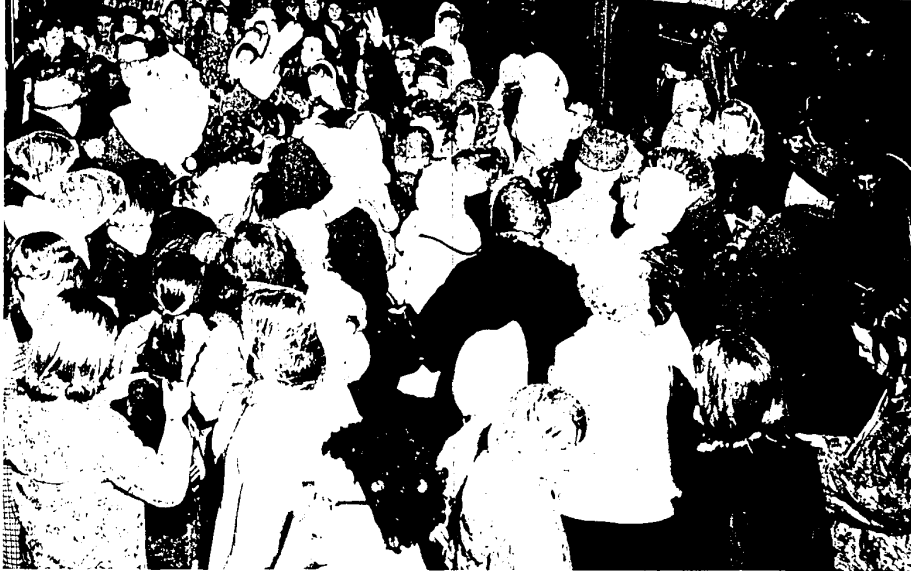
SANTA CLAUS ARRIVED on a fire engine last Friday instead of his usual sleigh pulled by eight reindeer because the weather was not very cooperative and a drizzling rain fell throughout most of the day. Hundreds of youngsters refused to have their spirits dampened by the rain, however, and were on hand with parents in the Farmington Plaza Shopping Center to greet Santa on his