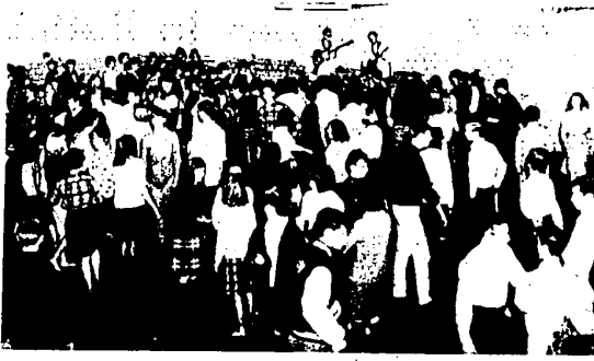
A SOCK HOP ATTRACTED OVER 400 area students to the Our Lady of Sorrows High School gym last Thursday night with a "Battle of the Bands" contest featuring the Callenies, Marauders and Cars drawing a enthusiastic response. The balloting went in favor of the Callenies who collected a $75 prize. The Future Medical Careers Club of