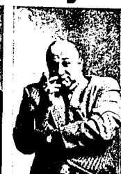
The Money-Making Type?

Consider leasing your car: dependable transportation, indisputable tax records, no time wasted on deals, trade-ins, maintenance.