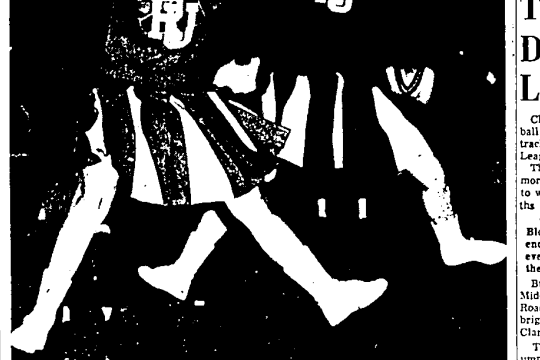
HIGH FLYING, jubilant cheerleaders from Redford Union had something to smile about in last week's 63-52 victory over Allen Park team.