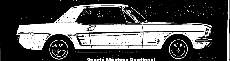
Sporty Mustang Hardtops!

Ford Custom 500 Sedans—choice of 2- or 4-door models, white or blue; Special equipment "extras" include Galaxie 500 all-vinyl seats, seat trim and exterior trim • full wheel covers • whitewalls. Powered by 150-hp Big Six. Specially priced options, too—Thunderbird V-8, Cruise-O-Matic, air conditioning!