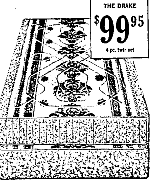
Mattress, box spring, headboard, metal frame