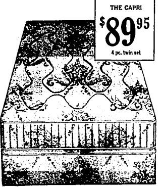
Mattress, box spring, headboard, metal frame