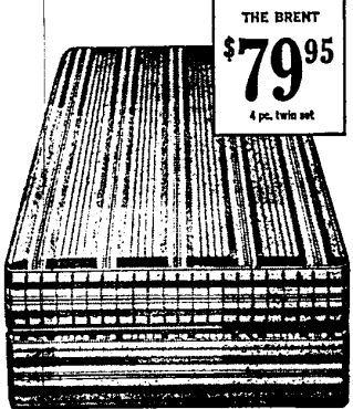
Mattress, box spring, headboard, wood legs

Projections for 1980 show that some kind of food stamp plan will probably be in effect. This will allow low income families to have consumption patterns similar to those of families who have incomes of $3,000 a year at present price levels.