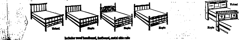
Includes wood headboard, footboard, metal side rails