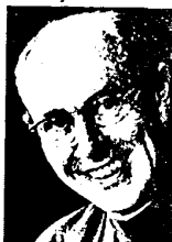
JOHN C. MURRAY, S.J.