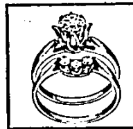
Wild Flower Light