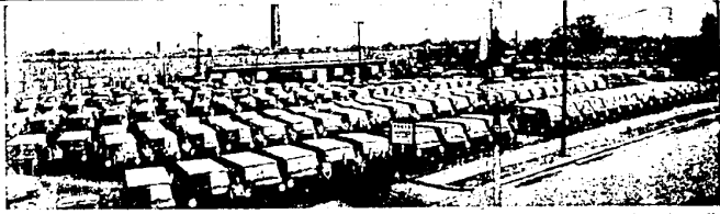
NO QUESTION about the ability of Sears to handle any calls for service to any of the appliances sold by the stores. This fleet of trucks is available at all times to take care of requests. Sears prides itself on answering calls within 24 hours and often-times on the same day if the request is received early enough.