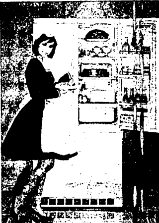
WARD'S NEW SIGNATURE "French Door" design refrigerator has a giant 18 cubic foot capacity in a space-saving 33 inch wide cabinet. This all features model has as standard equipment an automatic ice maker that can make and store up to 250 cubes and a medicine "shelf" for storing drugs with a "lock" which prevents small children from reaching them. Other features are a seven-day meat keeper, a vegetable crisper, magnetic door which is and roll-out freezer drawer.

The world situation in copper is so bad that the government has extended strict quotas on copper exports through the rest of this year. No easing of shortage is in sight.