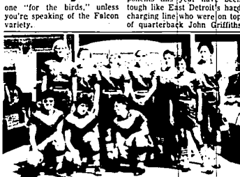
FARMINGTON CENTER GIRLS' SOFTBALL team battled their way back on Labor Day to end the season as runners up in the Class B Tournament. They lost the opening game to Midland, 5-2 then went on to defeat Detroit 6-4, Sault Ste. Marie, 6-2 and Portage 10-0, but lost to Midland in the final game.