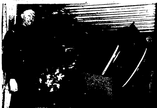
JUST ABOUT LOADED and ready to move to the furniture black market was the truck above being inspected by Farmington Township Police Detective Earl Teeple. Virtually everything that wasn't nailed down in

the Old Franklin Towne model home was crammed into the rented truck by burglars who were surprised at work early last Thursday morning.