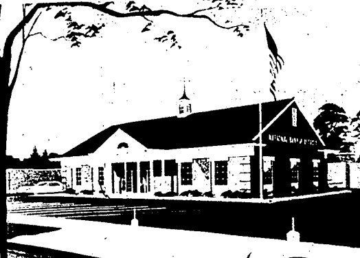
NATIONAL BANK OF DETROIT's newest building will hold open house festivities April 14 and 15. It is located at Middlebelt and 11 Mile Roads and replaces the temporary facility which has been serving Farmington since February 28, 1965.

Pit Stop MODEL ROAD RACING Headquarters FREE TRACK TIME FOR A & B STUDENTS (Bring Report Cards) AFTERNOONS - EVENINGS SUNDAYS TOO 476-8990 23430 Farmington Rd. Near Grand River