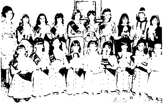
GIRL SCOUT TROOP 249 of North Farmington had an 'In-laying of dolls' on April 22. The dolls were the end product of weeks of work for the girls...