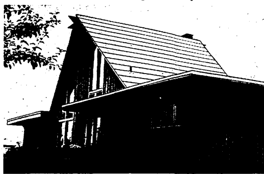
DRAMATIC ROOF OF THIS CONTEMPORARY-STYLE HOME WAS created with heavyweight asphalt shingles, special application techniques. Horizontal effect is achieved by using a triple or double course of light-colored shingles.

One of the ways homeowners can achieve individuality for their homes is to give special attention to the roof. The roof is the largest exterior surface of a home, yet it is often taken for granted in the development of the structure's aesthetics. Four out of five homes are roofed with asphalt shingles, but the design possibilities of this versatile material are often overlooked. An important step toward making the roof truly the "crowning achievement" of a home is the new trend of "designed roofs." A "designed roof" takes advantage of the wide choice of colors and blends available in asphalt roof shingles and makes use of a variety of application techniques for special effects—and pitched roofs with unusual drama. "How To" Ideas Listed These special effects can take the form of extra-heavy shadow lines, vertical and horizontal stripes, bordered effects and even silhouettes. The simplest and most common approaches to designed roofs are listed below: 1. Ribbon course application. This method was pioneered by the famed architect Frank Lloyd Wright. It involves the use of a triple-thick butt line at the eaves and at every fifth course of shingles. 2. Adaptations of this method include a double course instead of a triple course of shingles where a slightly less emphatic horizontal line is desired. 3. The spacing between the extra-heavy courses may also be varied. The ribbon course may be every sixth or seventh course.