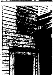
NEW SIDING, guttering can make an attractive difference in a home, as demonstrated here by before (above) and after (left) photos. Minimum-maintenance plastic siding and rain carrying systems used are of rigid vinyl. By the Monsanto Company.

Another variation of the ribbon course application is the use of the black starter strip on a white or light colored roof in place of the double or triple course of shingles. A one-inch exposure of the starter strip is usually sufficient to give the roof the effect of a strong shadow line.