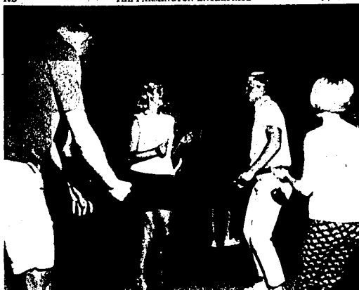
OVER 700 ATTENDED the Falc tennis court dance last Wednesday evening. The dances are a weekly and tremendously

popular summer activity of the teen YMCA group. Shown here are a few of the enthusiastic dancers.