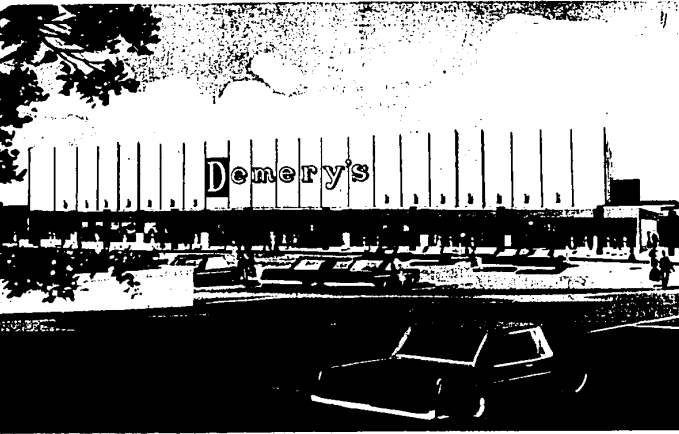
A CRISP, WHITE surface, with gold panels for contrast make the new Demery's Store at Twelve Mile and Farmington Roads an attractive focal point for the shopping center located there. The store has many features unique to retail merchandising.