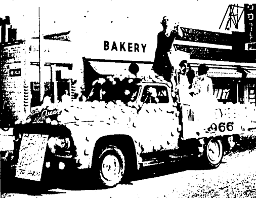
THE BEAUTY QUEENS were nice enough to let this un-dainty creature ride the truck with them and he just served to make them look that much prettier.