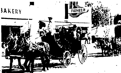
HORSE AND BUGGY DAYS of the old west were recalled as these vehicles passed by.