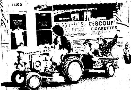
WHAT'S A PARADE WITHOUT a clown. This tractor came loaded with three of them.