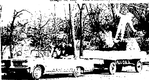
ENTERED IN THE HOMEcoming Parade by the 1966 Grand... this gridiron Falcon victory. Alas it was not, but the game couldn't have been topped for sufficiency rides to what he hopes will be a game and excitement.