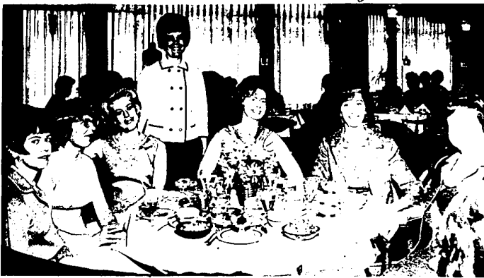
FARMINGTON WAS WELL represented at a recent spring luncheon and fashion show in the newly-decorated Western Golf and Country Club. Among those present were (left to right around the table)