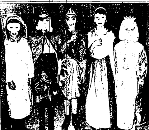
SPOOKS AND GOBLINS parade through the halls of the new Tanger School in late September. This group of gaily decorated youngsters stopped long enough for a picture and then continued their tour of the classrooms.

More than 200 attended the program for the presentation ceremonies and the election.