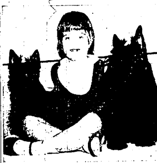
WHO WOULDN'T STOP and look at dogs when they run across this type of an appealing scene. This tiny miss was seated between the Scotties when the photographer happened by during the annual all-breed show at the Livonia Mall a week ago. We don't know whether the dogs won ribbons but this certainly is a blue ribbon picture.

The demonstrations will take place in Wards paint department on the first floor.