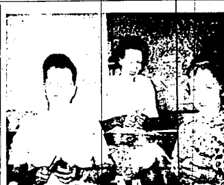
THESE MEMBERS OF Rachel Circle of St. Matthews Women's Society are preparing pins for the smorgasbord on Nov. 4 and 5 from 5 p.m. to 7 p.m.