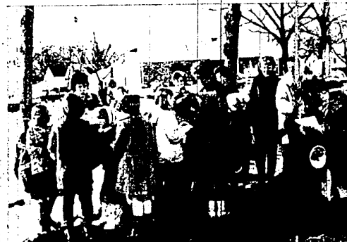
THE SCOUTS gathered in small groups while waiting their turn at the ladder and the tree. The leaders made last minute adjustments in the handmade ornaments and some of the scouts simply studied their sheet of Christmas Carols in the tree. The leaders made last minute adjustments in the handmade ornaments and some of the scouts simply studied their sheet of Christmas Carols in the tree.