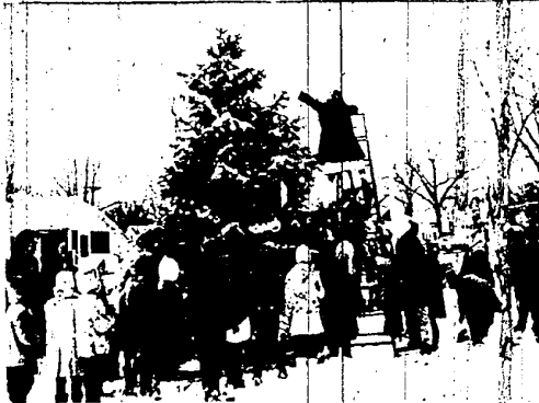
A TRADITION was observed in Farmington Monday when girl scouts from both the City and the Township gathered at the Farmington City Hall to decorate the Christmas Tree. The ceremony was postponed from last week because of the rain, but that just gave renewed enthusiasm to the scouts.