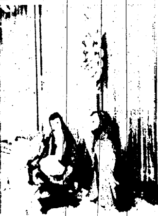
A CRECHIE was added to the decorations at the City Hall this year. Junior Girl Scouts constructed the scene from papier mache as part of their work on Art Badges.