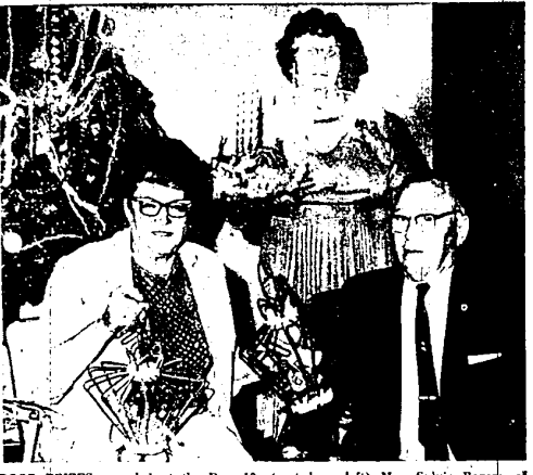
DOOR PRIZES awarded at the Dec. 19 Christmas party held by the Westland Senior Citizens sponsored by the Parks and Recreation Department, are displayed by the proud winners. Prizes went to