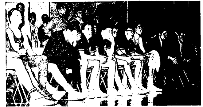
A SAD SAD STORY: This scene on the Bentley bench typifies the night the Bulldogs had against Catholic Central in the regional finals. Bentley never could get untracked and was crushed, 75-43, in the title game.