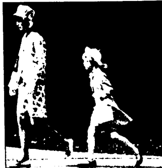
THE YOUNGER GENERATION also spruced up in Sunday best and went to church. Some had to hustle to get to services on time.