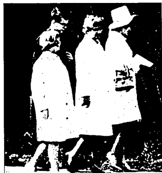
LIGHT AND BRIGHT was the order of the day for Easter paraders. Most churches in the area held several services to accommodate the Easter crowds.