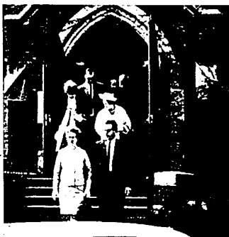
MINISTERS shook hundreds of hands at the close of services. Parishioners had the best weather in years for enjoying the wearing of Easter finery.