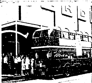
A TWO-DECK English bus carried hundreds of youngsters to the Teen-Age Fair. Leased by Wonderland Center, the veteran of London traffic made six round trips daily during the fair, which closed April 2 after a successful 9-day show at Cobo Hall.