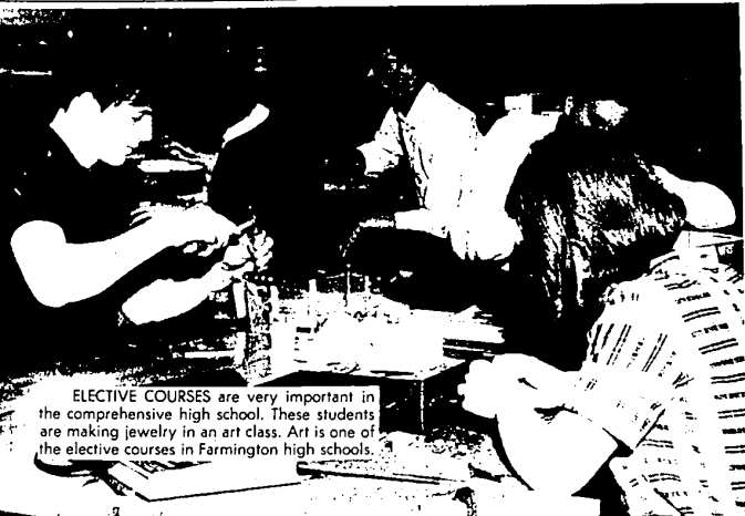
ELECTIVE COURSES are very important in the comprehensive high school. These students are making jewelry in an art class. Art is one of the elective courses in Farmington high schools.