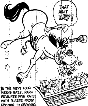
IN THE NEXT FOUR WEEKS HAZEL PARK FEATURES FIVE RACES WITH PURSES FROM $20,000 TO $50,000.

The mile relay also won for Sorrows. They race Saturday in the regionals.